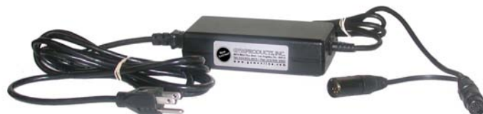
4-pin XLR connector